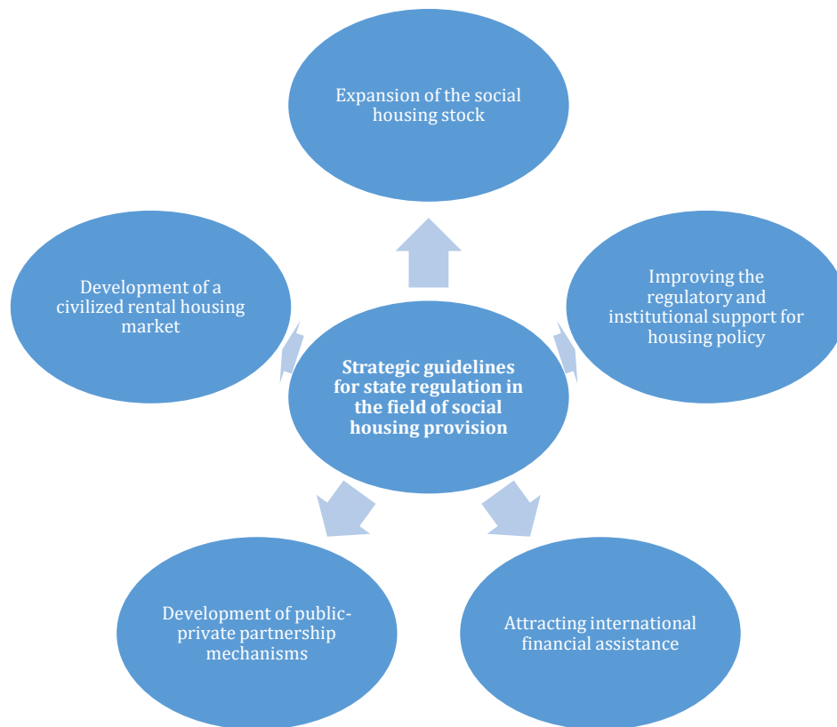
Figure 3. Strategic guidelines of state regulation in the field of social housing (developed by the author independently)

destruction of the housing stock, an increase in the number of internally displaced persons and regional imbalances in the provision of housing actualize the need to improve the state housing policy.